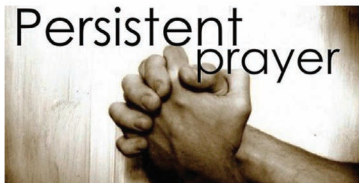
TWENTY-NINTH WEEK OF ORDINARY TIME

Tuesdays through Fridays 1:00 - 4:00 PM in the CHURCH 4:00 - 8:00 PM in the CHAPEL